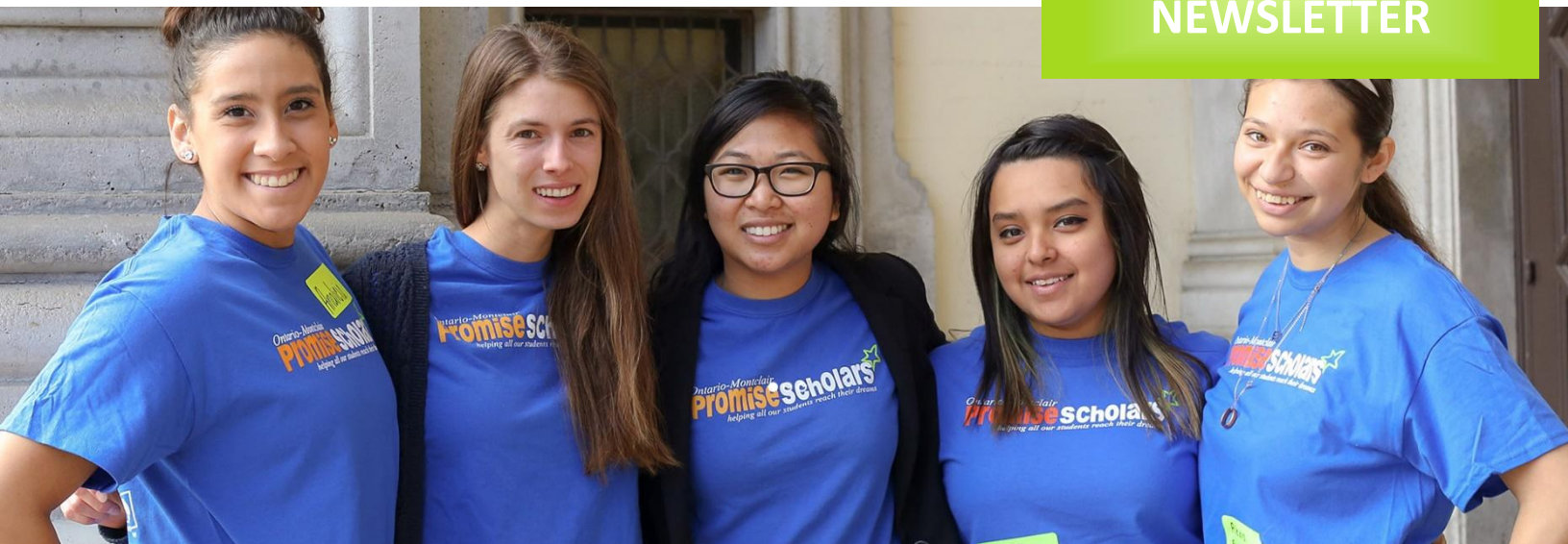
AmeriCorps Members and Chaffey high Student Advisory Council members.